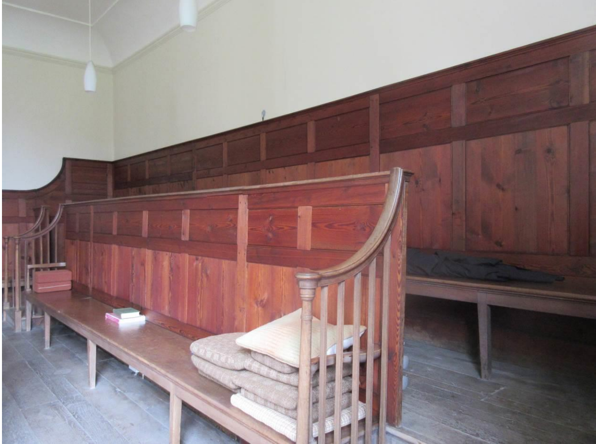
Figure 2: Stand in main meeting room